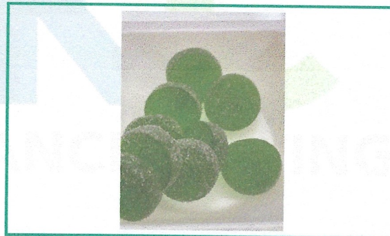
The photo on this report is of a sample collected by the lab and may vary from the final packaging

LOQ = Limit of Quantitation; Unless otherwise stated all quality control samples performed within specifications established by the Laboratory. SOP.00026 Micro, Plating and PCR